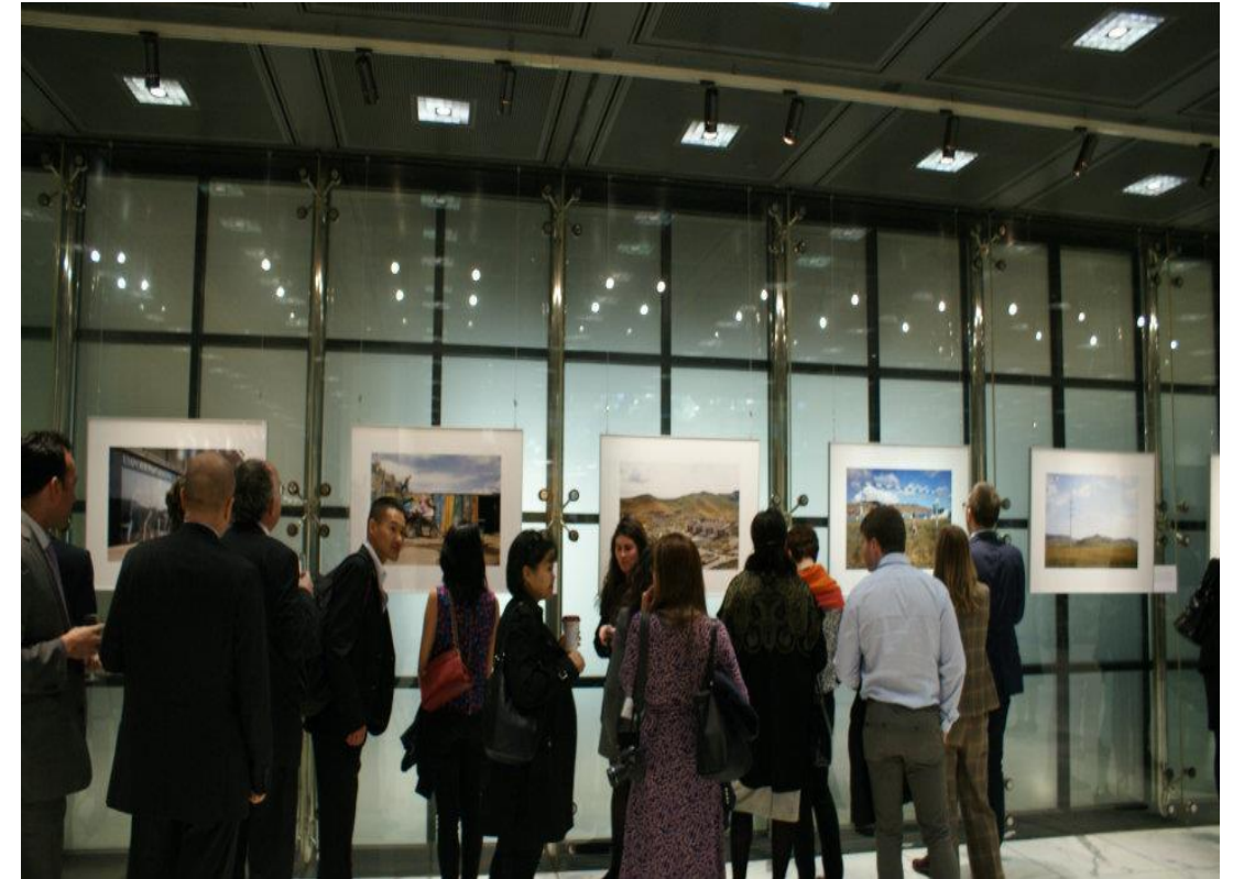
EBRD'S WOMEN IN BUSINESS AWARDS 2012 XOT exhibition London, 2012