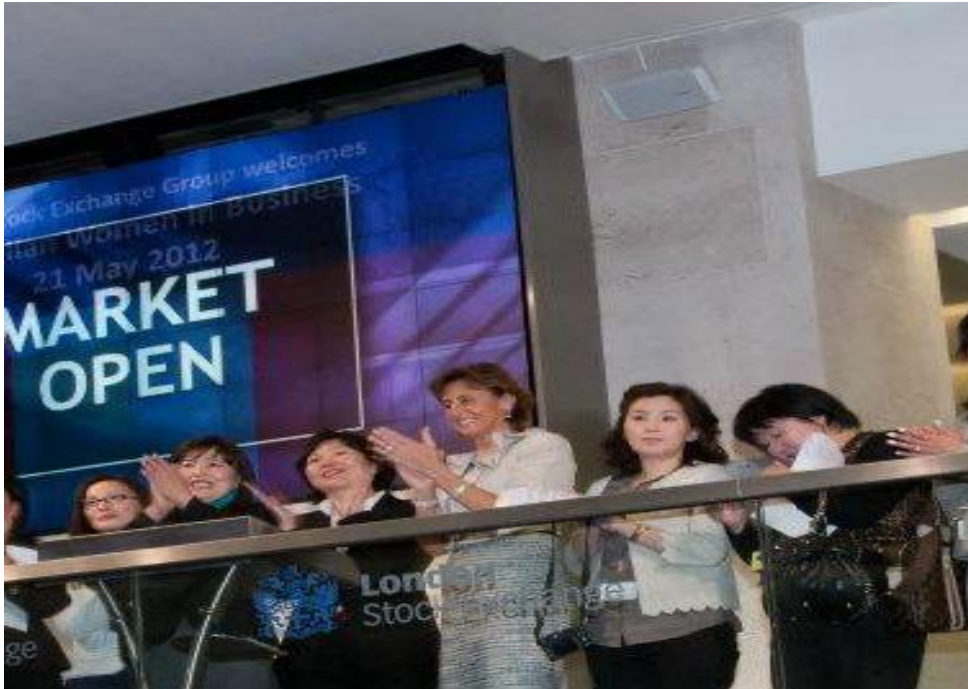
Opening Bell Ceremony for Mongolian delegation “Mongolia Investment Day” 2012