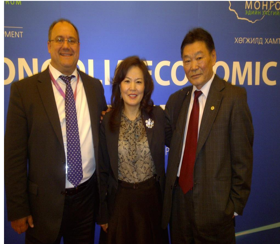
National Bank of Canada's representative attended MEF and invested in Khas bank and became a shareholder