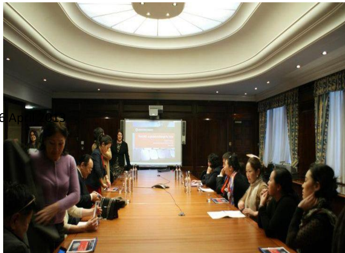
Members from Mongolian Accounting Association visited LME, 6 April 2013