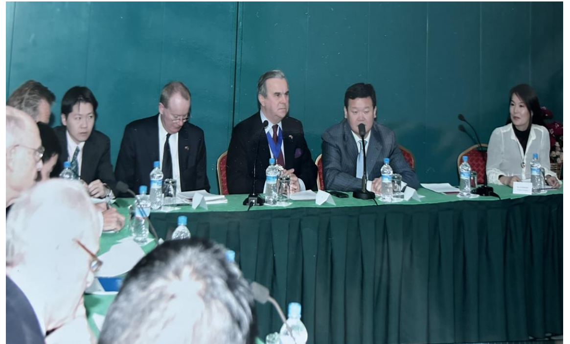
Roundtable meeting “Mongolia and International Financial Center” Ulaanbaatar, 2006