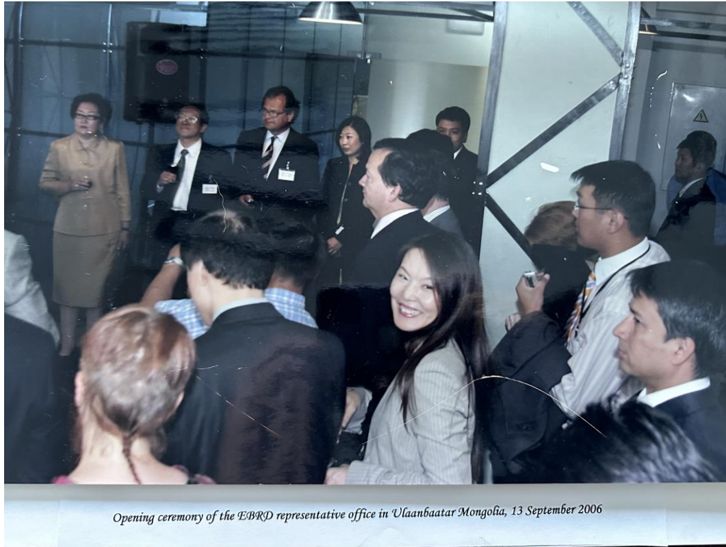
Opening ceremony EBRD's representative office in Ulaanbaatar, 2006