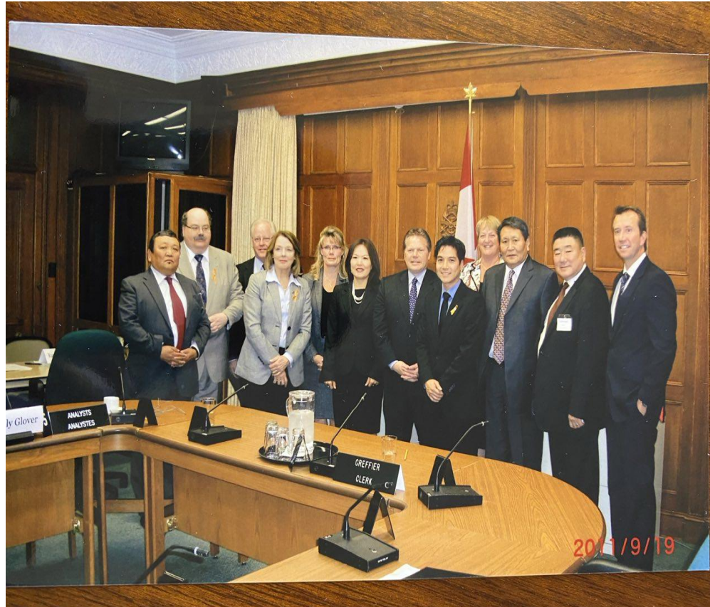
Mongolbank delegation, Parliament of Canada, 2011